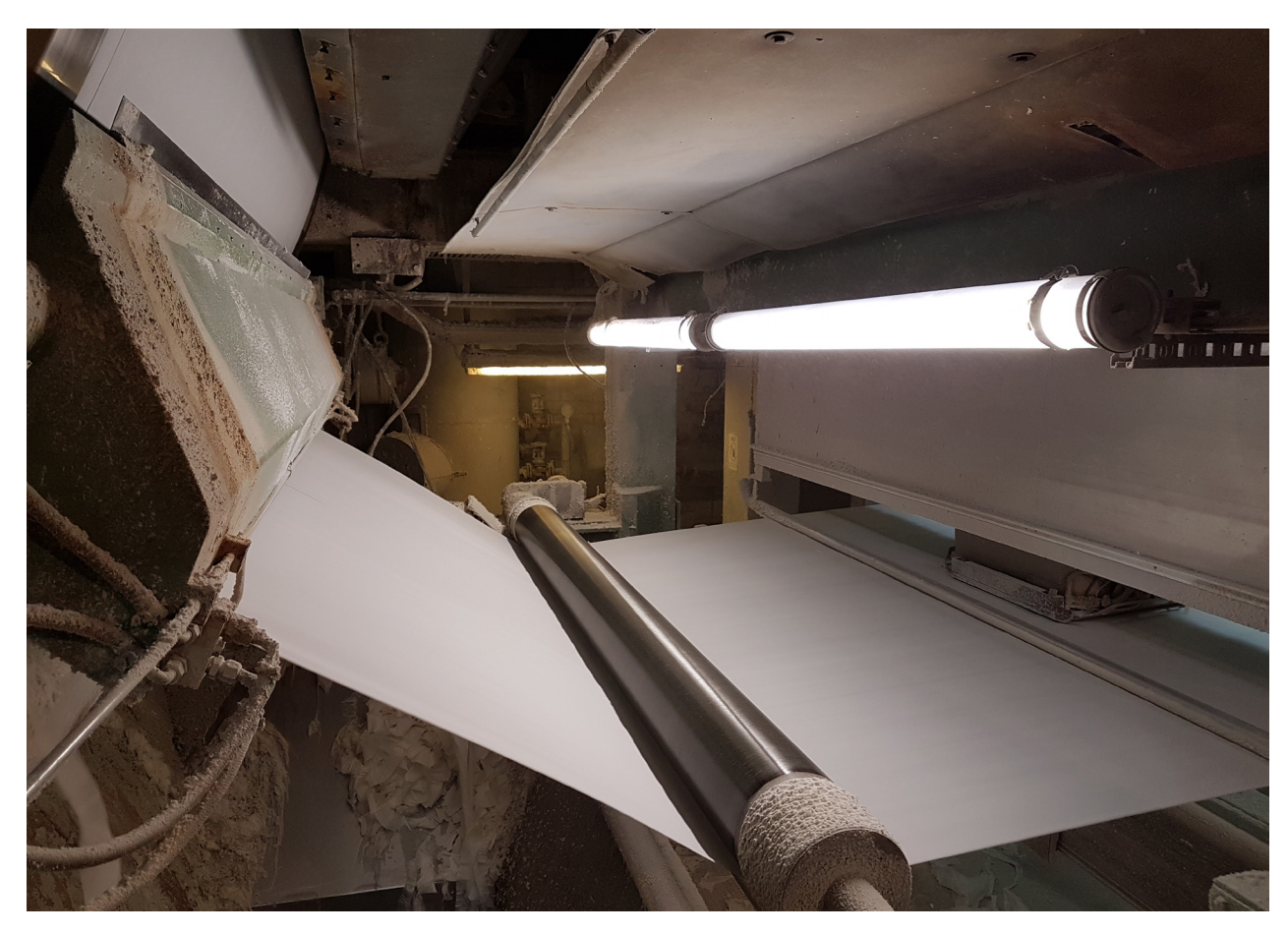
Papierfabrik Cartaseta, Schweiz.