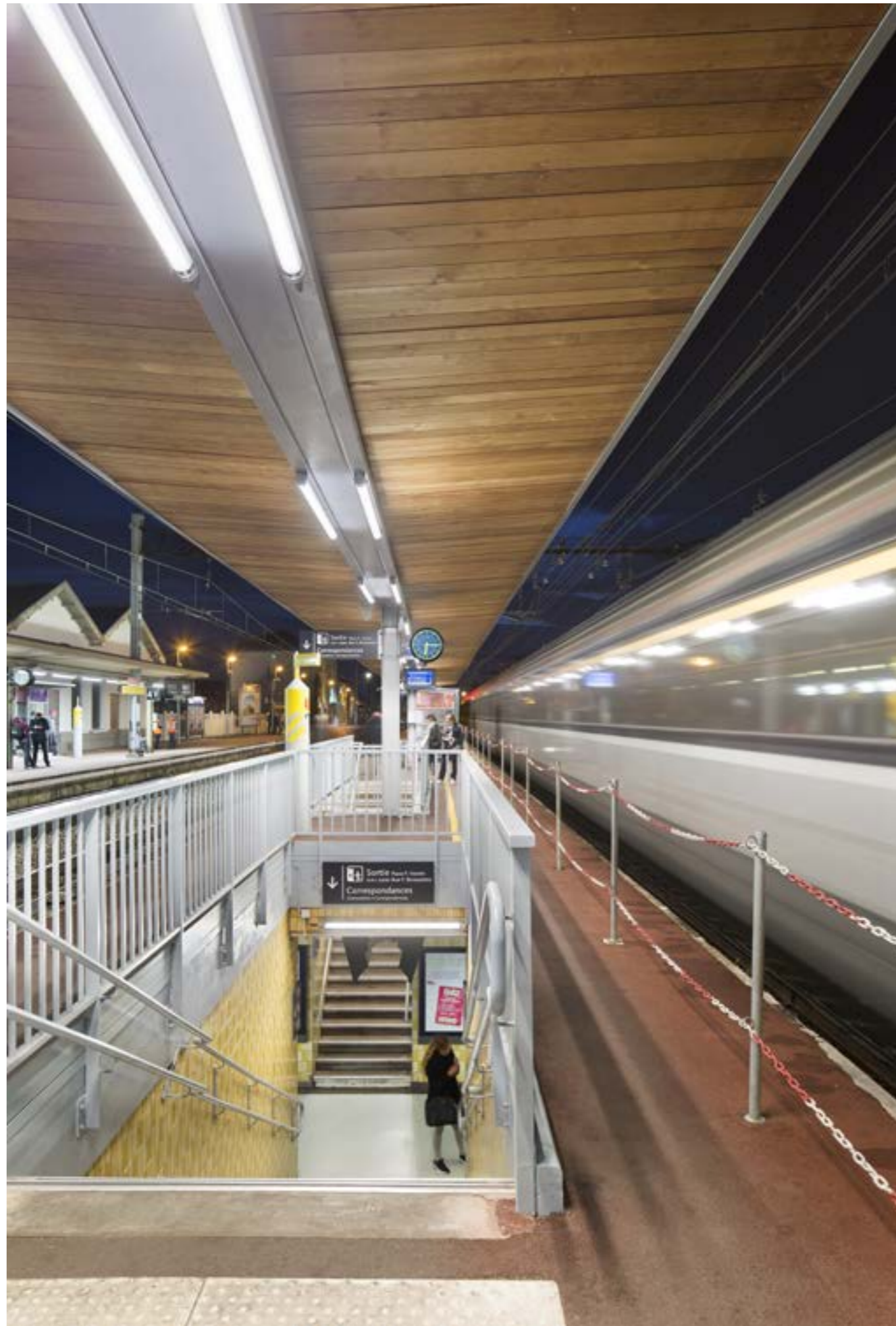
Brétigny-sur-Orge station, near Paris, France. Luminaires: Turner.