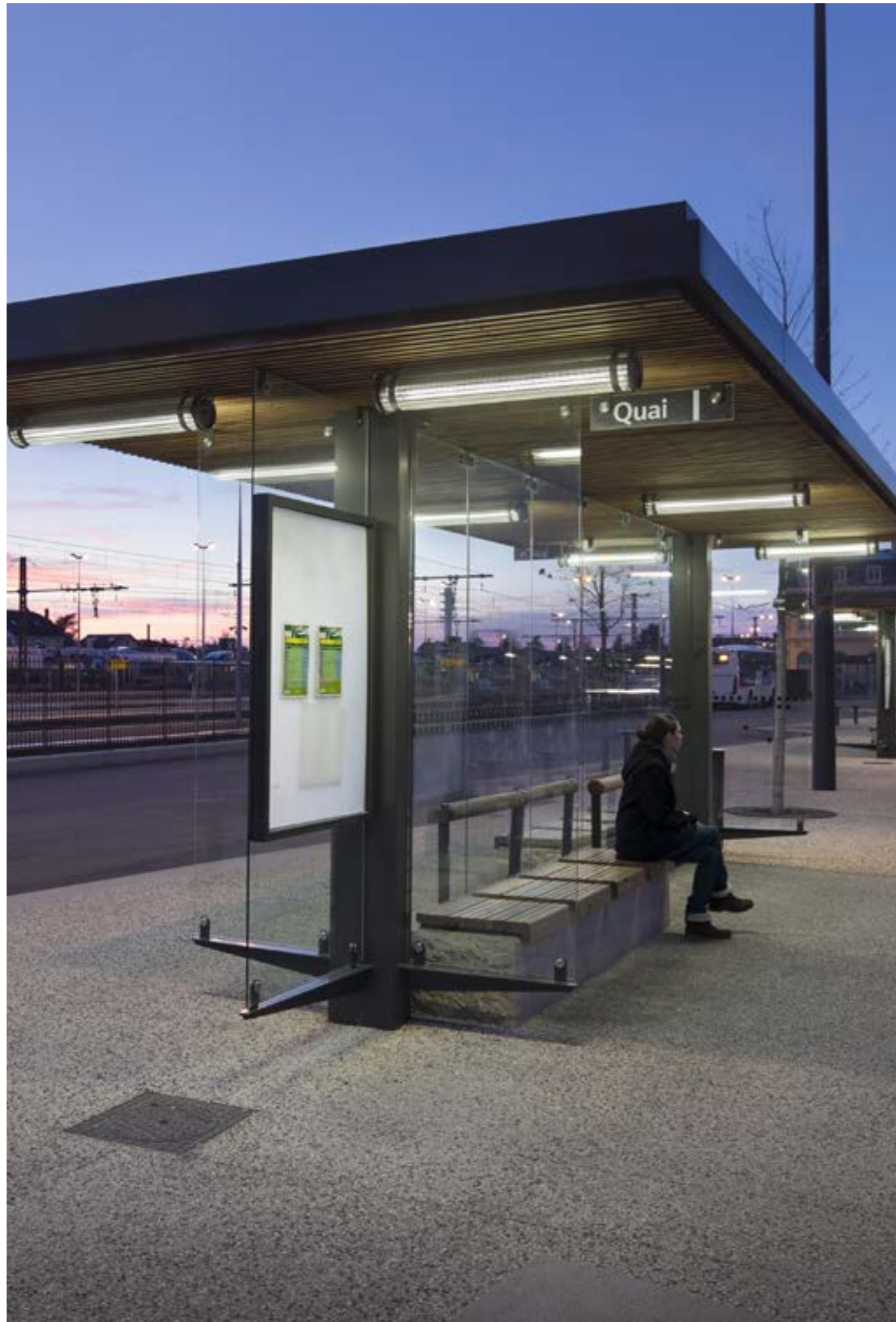
Bourg-en-Bresse station, France. Luminaires: Custom made.