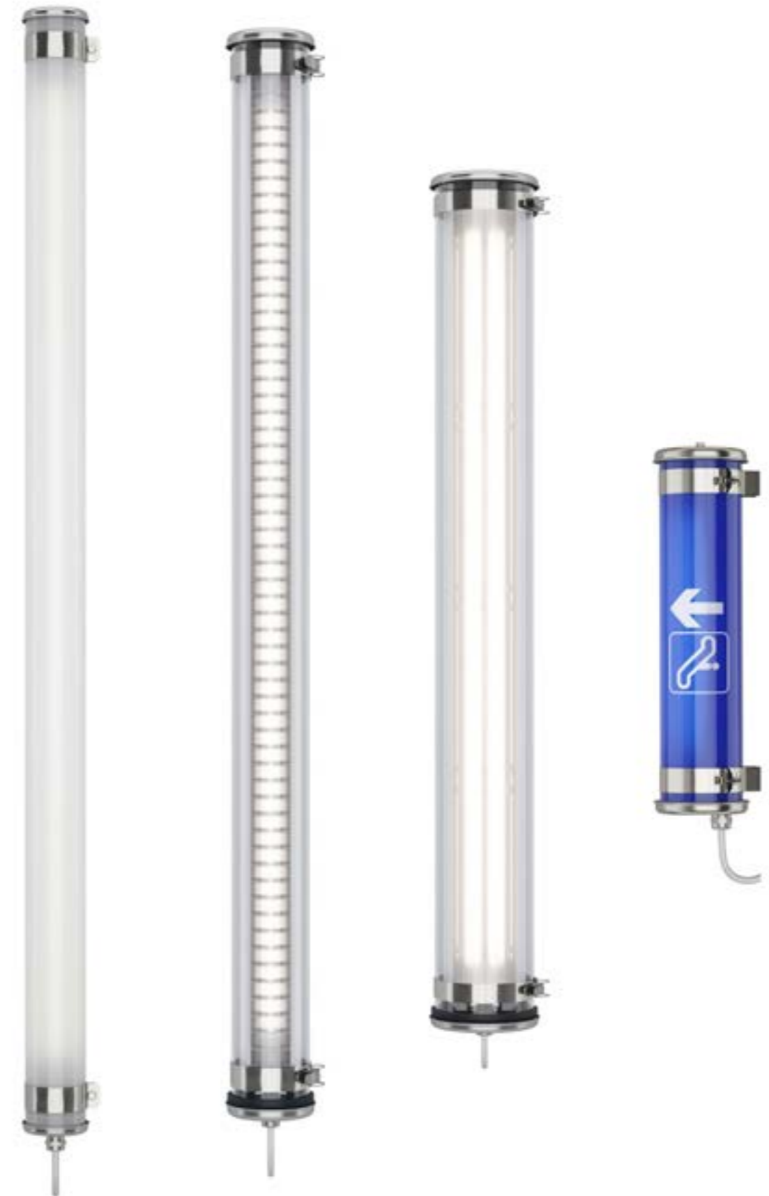
Luminaires: from left to right, Turner, Brueghel, Duplessis, Mabuse.