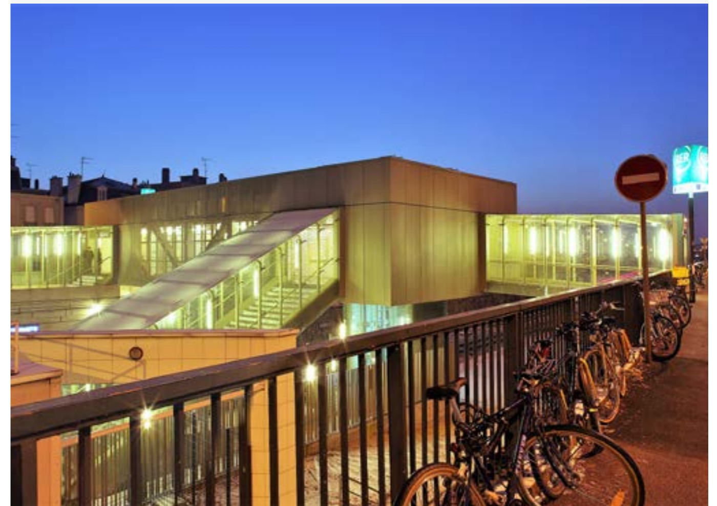
Above: Ermont-Eaubonne station, near Paris, France. Luminaires: Uhlend.