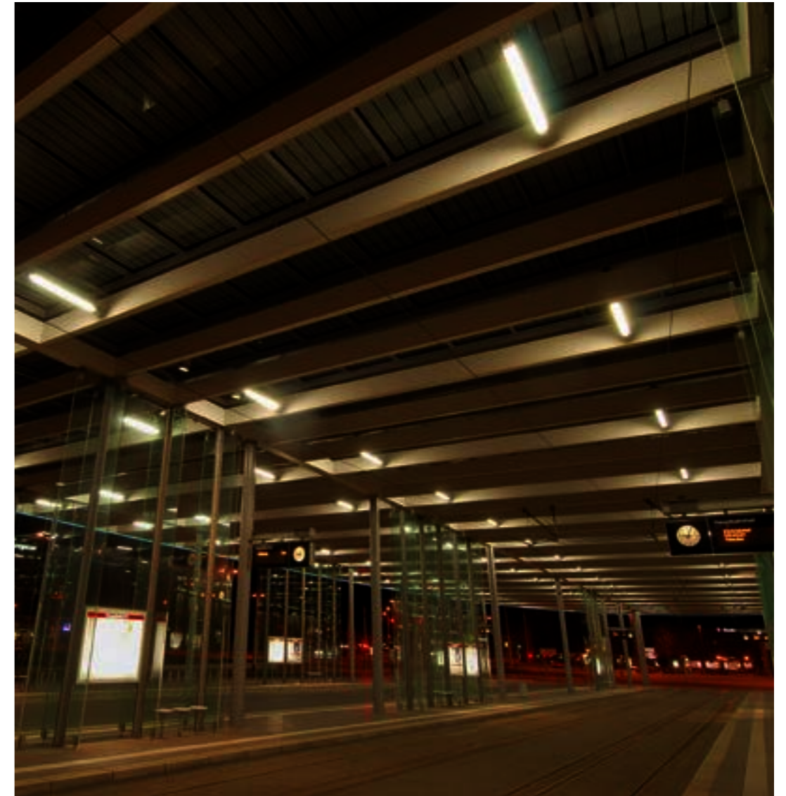
Above: Tram and bus station, Brunswick, Germany. Luminares: Valadon.